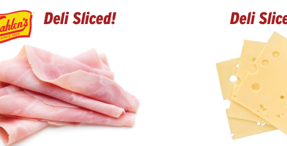
99 SAHLEN'S HAM PER LB. OFF THE BONE