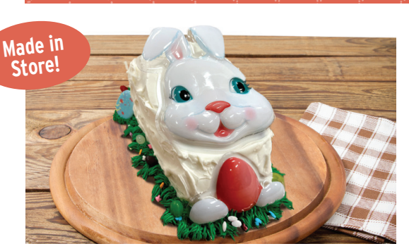
15.99 Easter Bunny Cakes Yellow or Chocolate 24 oz.