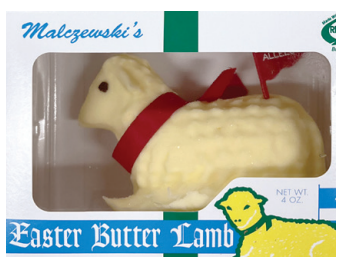
Malczewski's FAMOUS BUTTER LAMBS