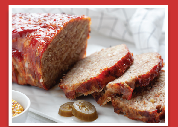
$ 8 <sup>EACH</sup> Meat Loaf Dinner with 2 sides!