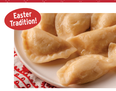
PIEROGIES! Available Barbie's or Babcia's Now!