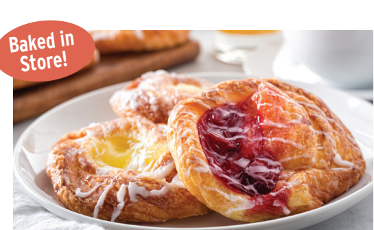
MINI DANISH 12 ct. Assorted Varieties • Pre-packaged