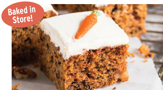
8" x 8" CARROT CAKE with Cream Cheese Icing • 18 oz.