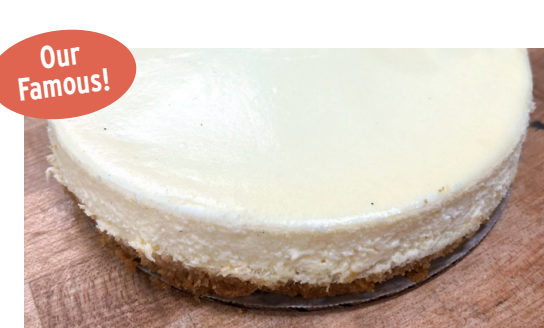
18.99 POLISH CHEESECAKE 32 oz.