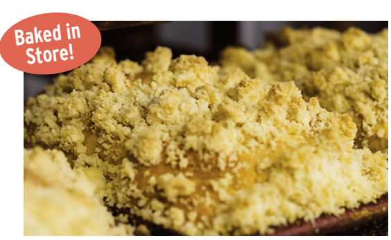
Polish Placek 16 oz. • Plain or Raisin 6.99