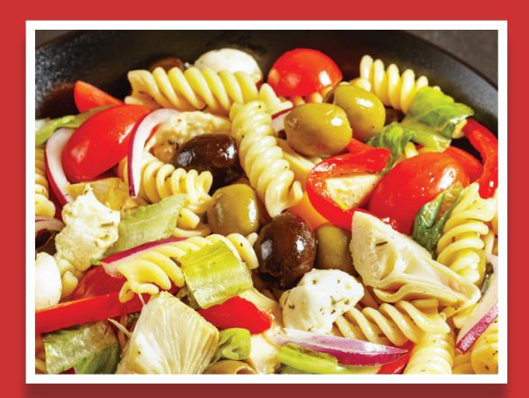
Assorted Pasta Bowls