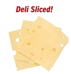
699 SWISS CHEESE