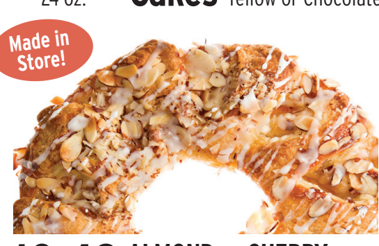
10.49 ALMOND or CHERRY ALMOND RINGS 20 oz.