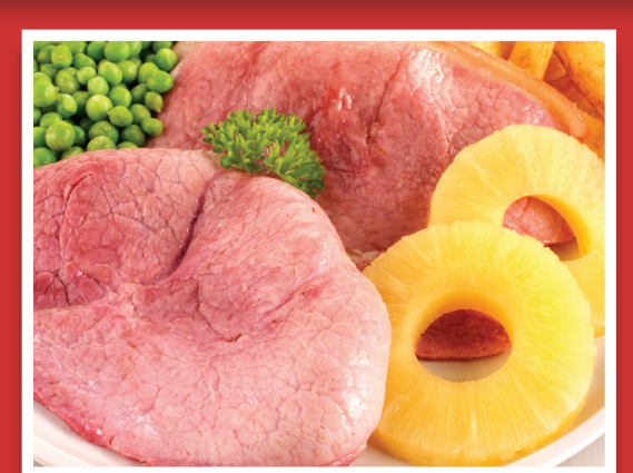
$899 EACH Complete Brown Sugar and Pineapple Ham Dinner